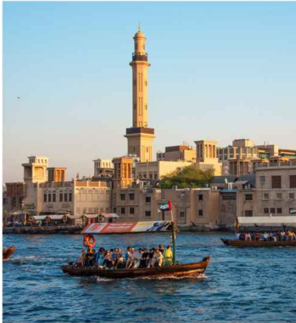
ABRA CREEK CROSSING The AED 1 Journey That Connects Old and New Dubai