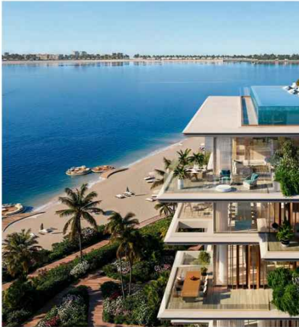
DUBAI ISLANDS Where the Next Phase of Waterfront Living Begins