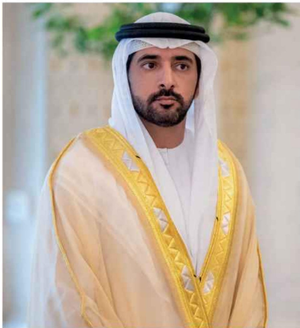
AED 1 BILLION SUPPORT PACKAGE How Dubai Is Protecting Jobs and Strengthening Its Economy