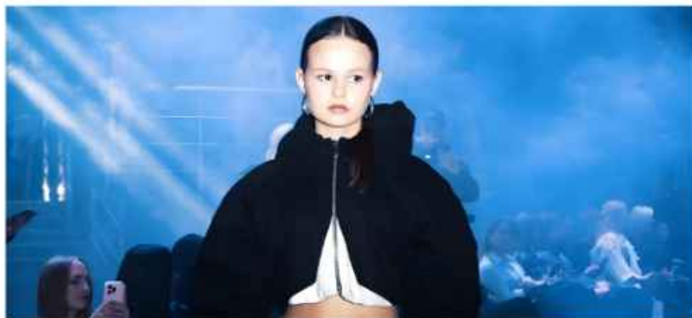
NIGHT OF THE NARCISSUS

From the heart of the city to the shores of the Palm, a new standard for high-society fashion emerges this May.