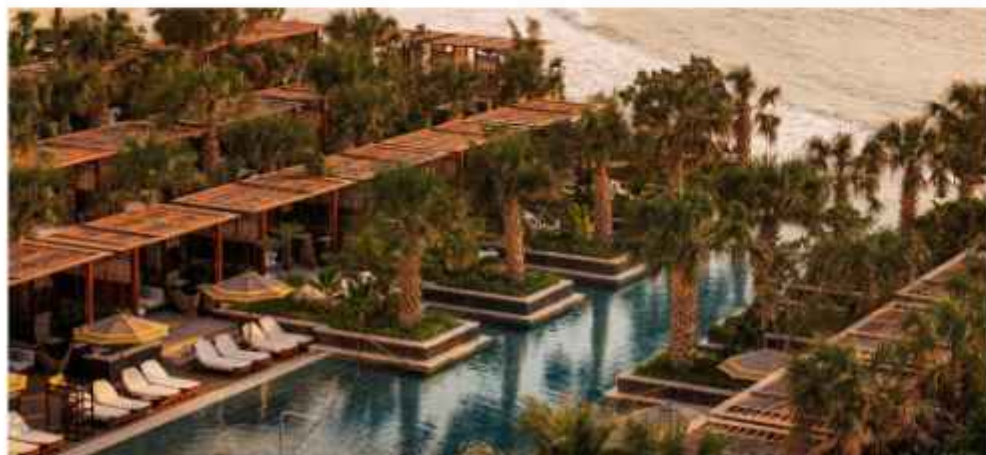
ISLAND SOUL: BALI-INSPIRED ESCAPES