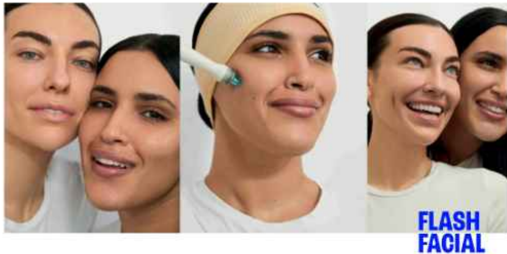
FLASH FACIAL The 15-Minute Treatment Redefining Skincare in Dubai

In a city that moves fast, beauty routines are evolving to keep up.