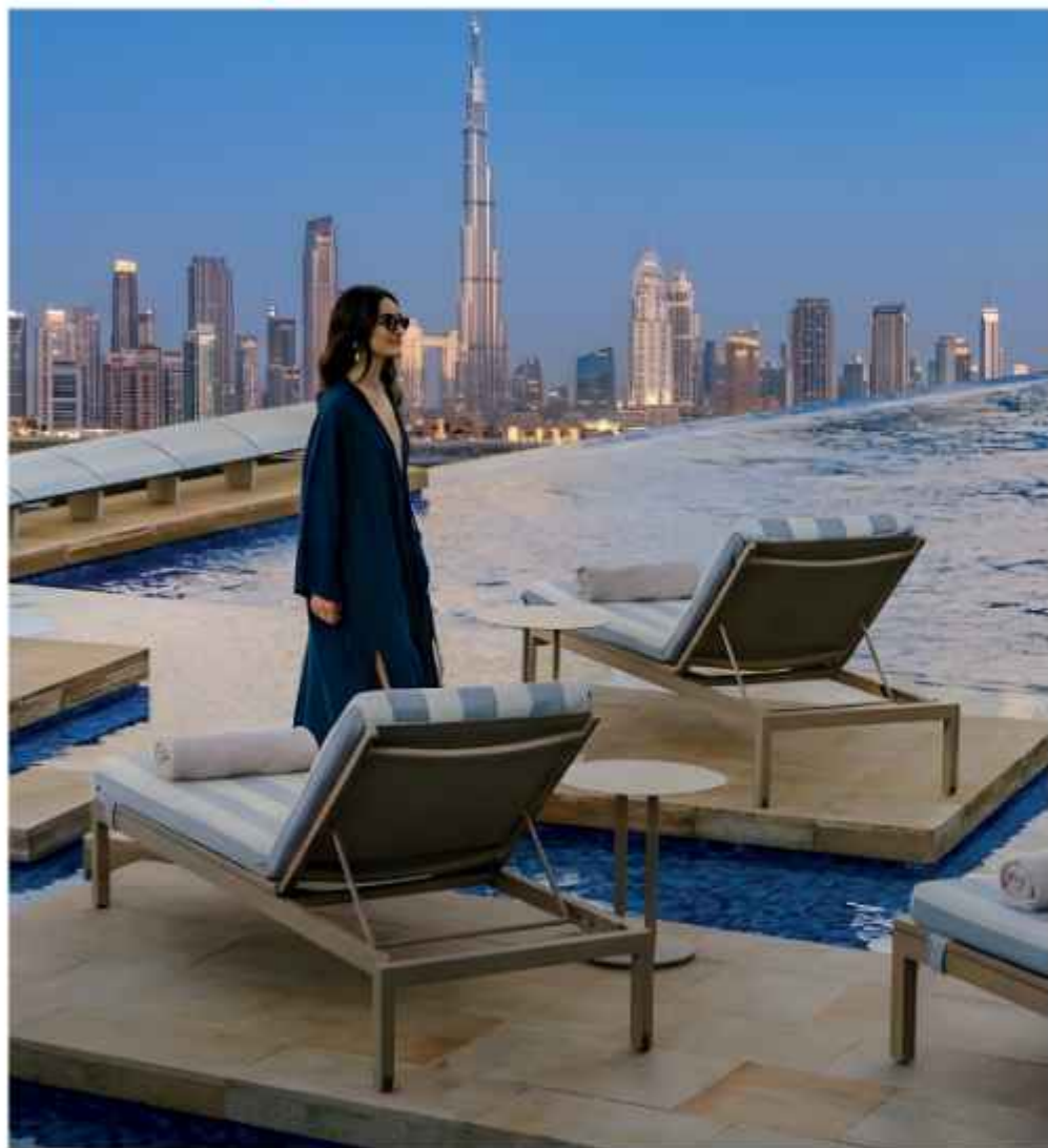
ADDRESS HOTELS + RESORTS A Refined City Escape in the Heart of Downtown Dubai