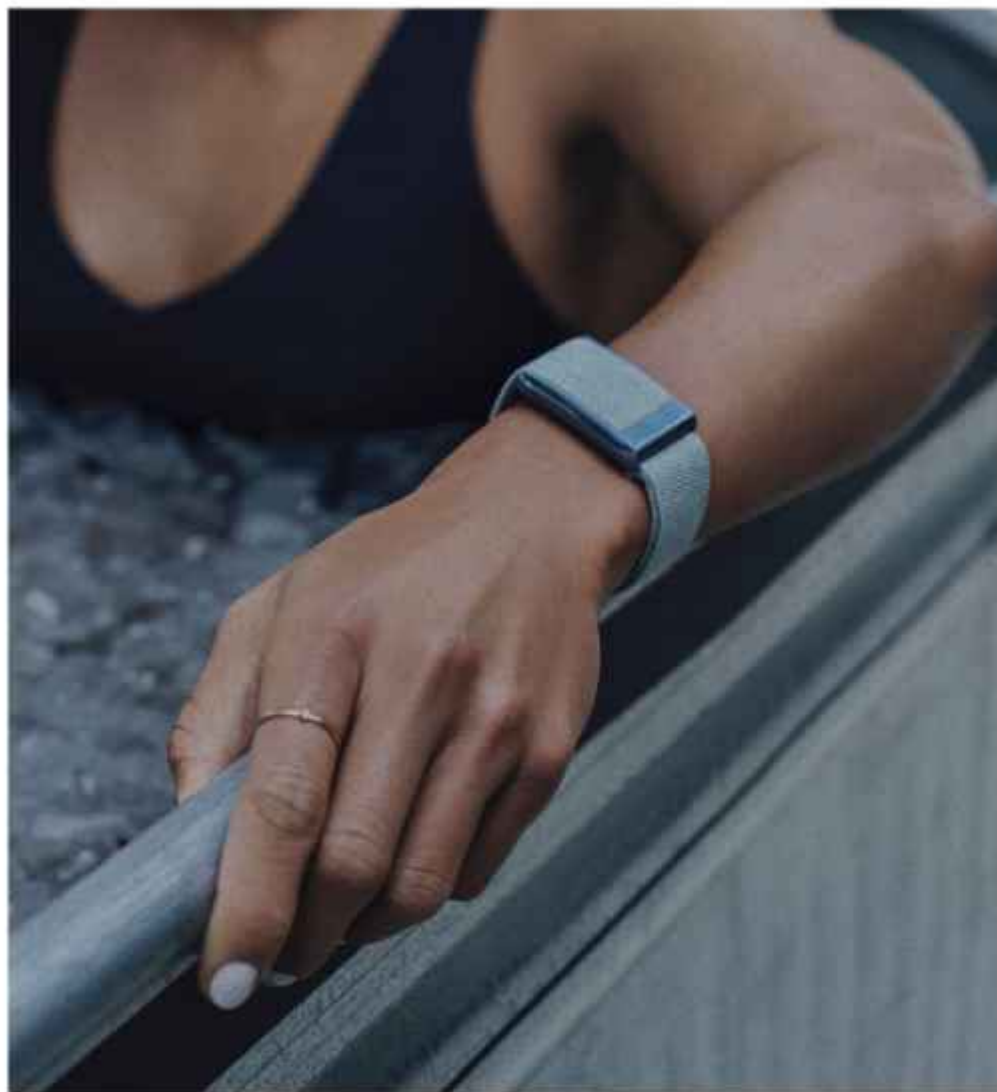
WHOOP The Performance Wearable Quietly Changing How Dubai Lives

In a city driven by movement, ambition, and performance, wellness is becoming increasingly data-driven. WHOOP — the screenless performance wearable used by athletes, founders, and high-performers globally — is redefining how people understand recovery, sleep, and daily performance. Unlike traditional smartwatches built around notifications, WHOOP focuses entirely on optimization.